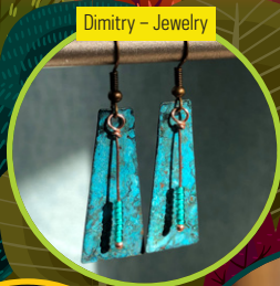
Dimitry - Jewelry