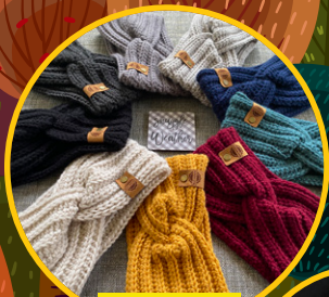
Walker - Knit wear

$5 Admission (Cash ONLY) Ages 10 and under—FREE! Over 250 Craft Booths Concessions • Package Pick Up No Strollers Please!