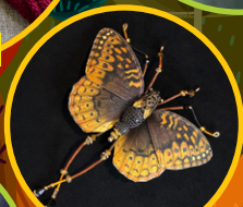
Heires - Arthropod pins