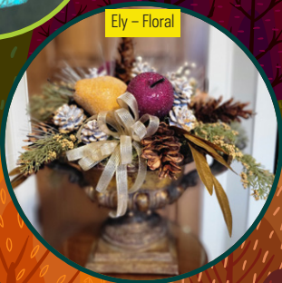
Ely - Floral