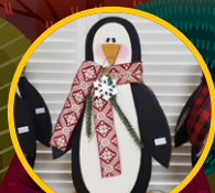
Yuker - Seasonal