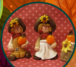
Renner - Mini clay figures